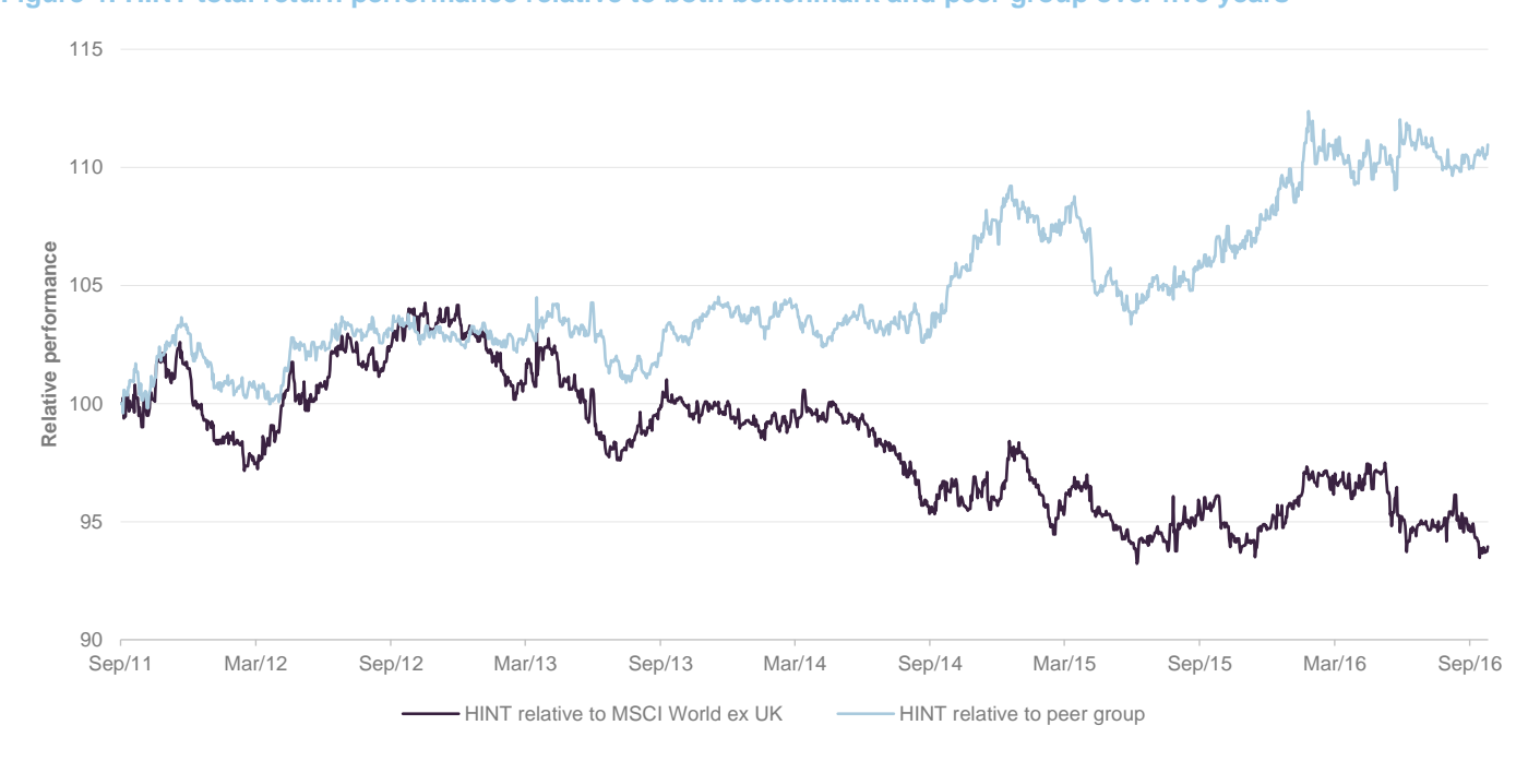
Figure 4: HINT total return performance relative to both benchmark and peer group over five years

Figure 4 shows HINT's strong outperformance of its peer group over the past five years. HINT's performance relative to the comparative index has been fairly flat over the last couple of years.