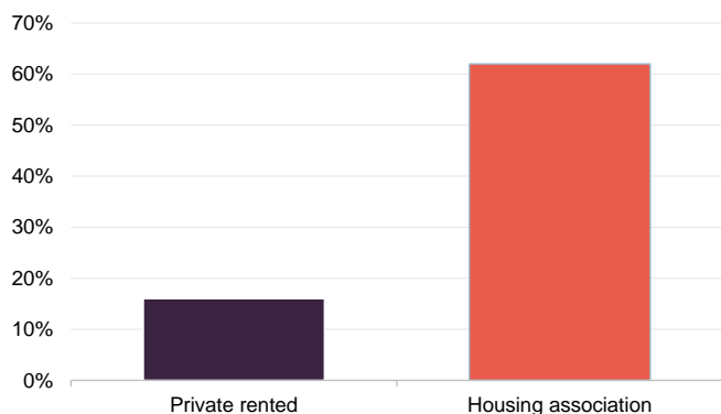
Figure 2: Still in accommodation after five years