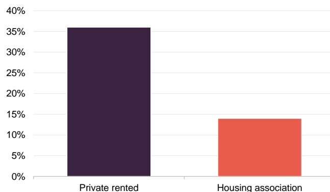
Figure 3: Returned to homelessness after five years